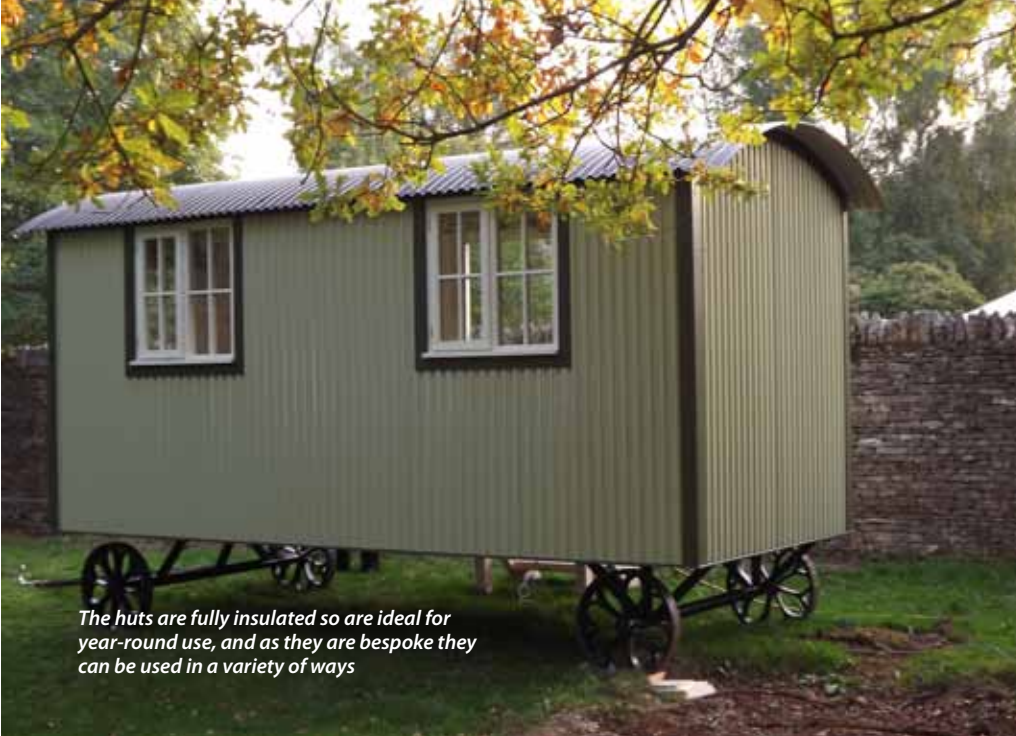
The huts are fully insulated so are ideal for year-round use, and as they are bespoke they can be used in a variety of ways